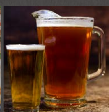
One 64oz. Pitcher any Draft Beer