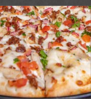
Any XL Specialty Pizza